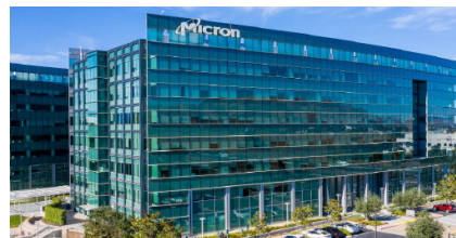
HQ @ First Prime Single Tenant, San Jose, CA