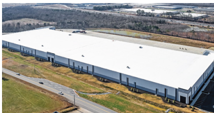
Calhoun 75 Industrial, Atlanta, GA