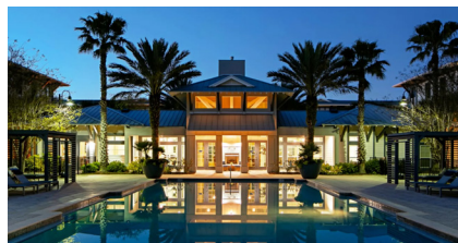
Beach House Multifamily, Jacksonville, FL