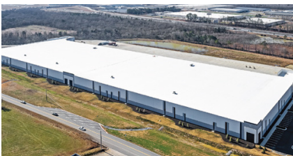
Calhoun 75 Industrial, Atlanta, GA