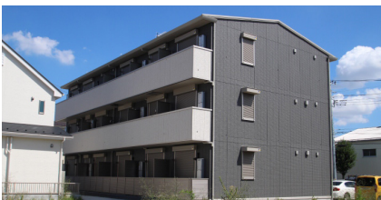
Tokyo Multifamily Portfolio I Multifamily, Tokyo Japan