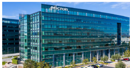
HQ @ First Prime Single Tenant, San Jose, CA